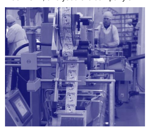
Understanding the energy efficiency of each of Safir's components enabled the consultant to recommend energy saving solutions.

We connected the business with a local energy efficiency consultant to conduct an energy audit and find ways of reducing the company's energy consumption. The consultant, Quartz Matrix SRL, analysed the company's