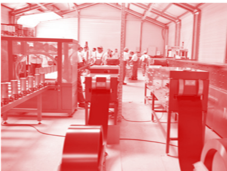
The new system introduced a zoning system for different areas of production.

However, with this expansion came new organisational challenges. Final Distribution had grown organically, but this meant they didn't have the internal procedures to coordinate their new scale. Lack of clearly defined storage space meant it was difficult to manage the warehouse, leading to delays in handling orders, or even misplacing orders and products entirely. When we started working with them, Final Distribution had 39 employees.