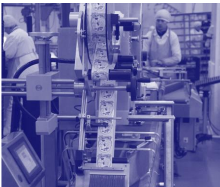
Understanding the energy efficiency of each of Safir's components enabled the consultant to recommend energy saving solutions.

We connected the business with a local energy efficiency consultant to conduct an energy audit and find ways of reducing the company's energy consumption. The consultant, Quartz Matrix SRL, analysed the company's